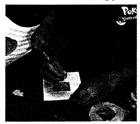
Student using a cardboard frame to cut out a 2 inch square tile.

When a class came to my art activity they were told to take off one of their shoes and inspect the sole for interesting textures and patterns, (most students were tennis shoes). The students were given a golf-ball-size piece of clay and told to flatten it to about h inch thick and then press the interesting part of the sole of their shoe into the soft clay. Next, they received a piece of poster board 4 inches square with a 2-inch square cut out of the middle. This frame was laid over the most interesting part of