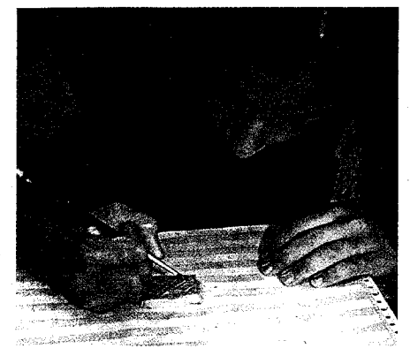
Student using a small brush to glaze the wet clay tile.

terflies, flowers, bees, cartoon characters and other types of interesting patterns. Usually these images were only seen by the custodian when cleaning those impressions from the floor after students had come in after a rainy day. Now the images are always present in the school, year after year, rain or shine.